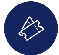
Fund Transfer Solutions (TITO/Cashless)