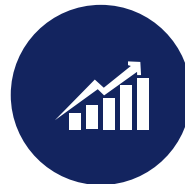
Online Financial Accounting and Reporting