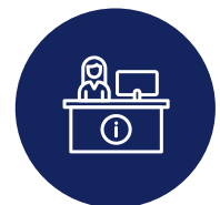
Member Management / Reception System