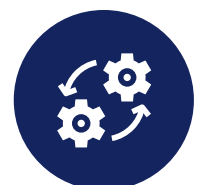
Third Party System Integration